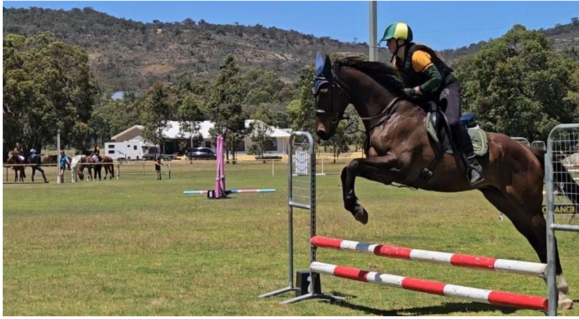
Tatum and Milo look ready for the Showjumping Series