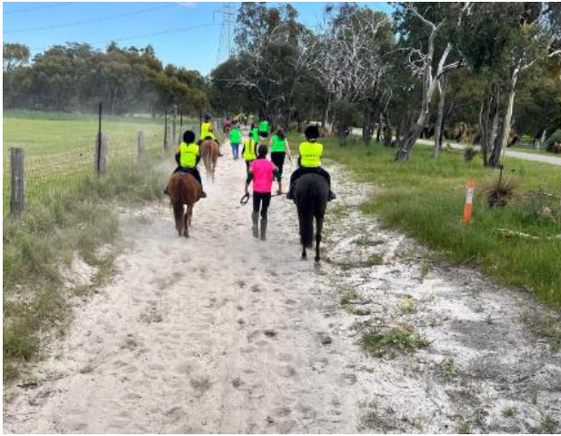
Above: Out and about on the trail