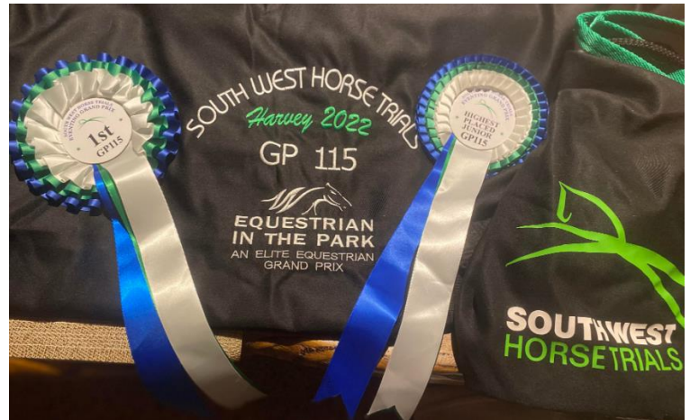
Right: Teagan and Digby competed in the 115cm class at the South West Horse Trials Grand Prix. They rode against some tough competition, knocking one rail but clearing the joker to win the class! Great opportunity to practice in anticipation of the upcoming Equestrian in the Park.