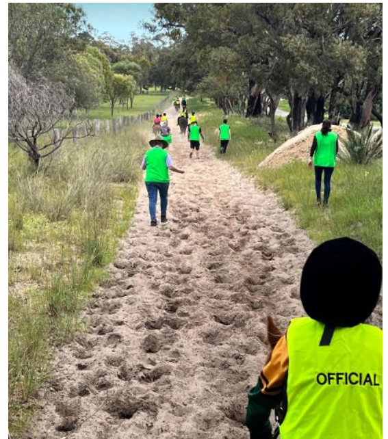
Right: Our wonderful helpers doing a great job walking through the sand