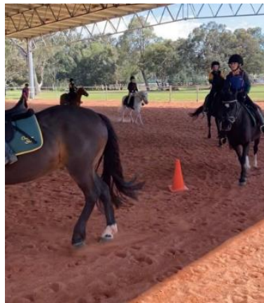
Left: Pear group enjoying their flatwork lesson