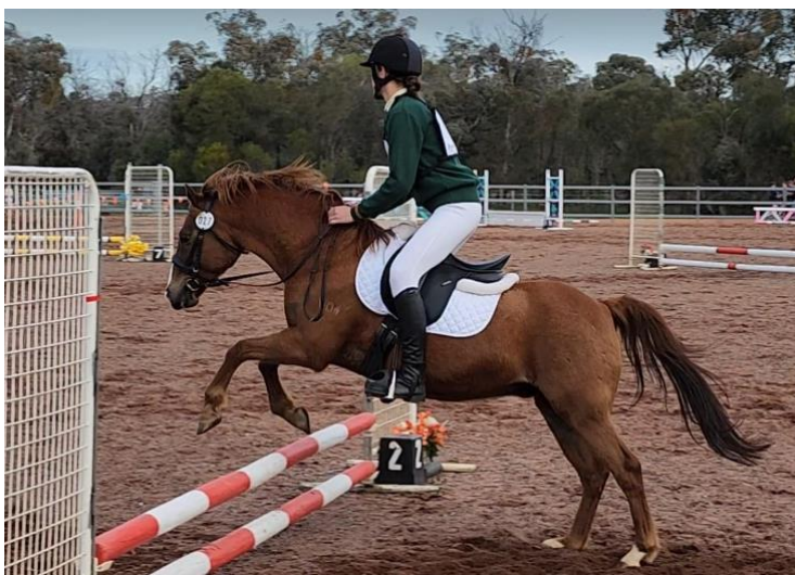
Above: Maniah-Rose and Piper jumping well during their showjumping round at the Dryandra ODE