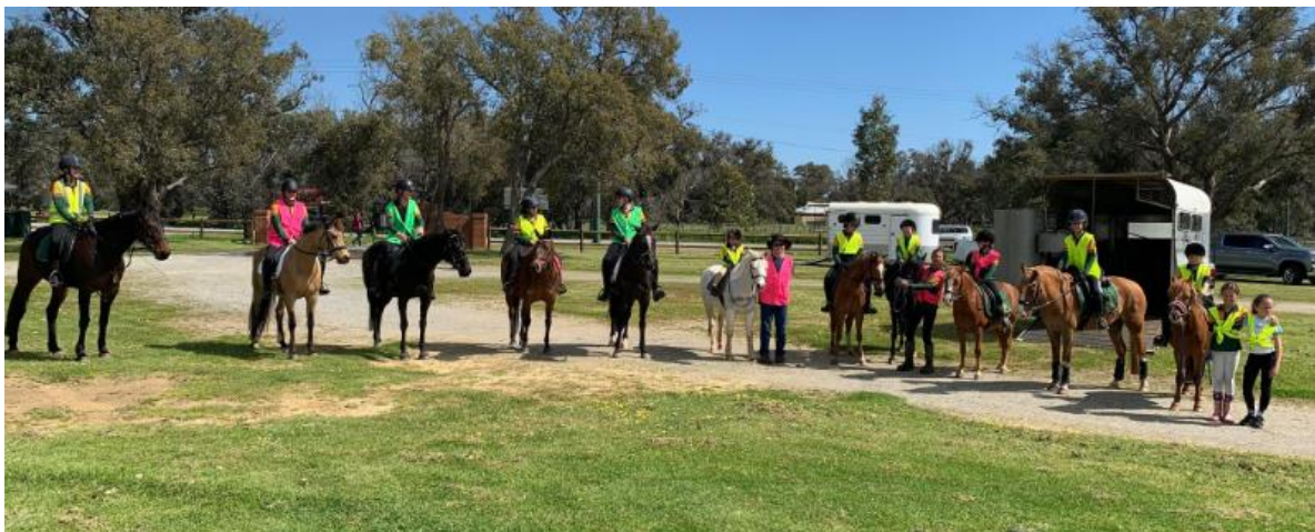
Above: Group photo of our riders getting ready for their trail ride