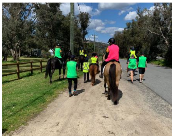
Above: Our trail ride group about to start on their journey