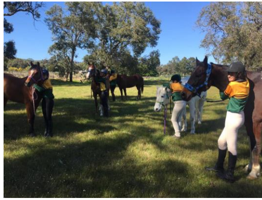
Left: Watermelon group spending some time bonding with their ponies