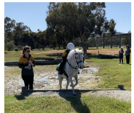
Below: Jasper and Shadow having fun on the cross country course