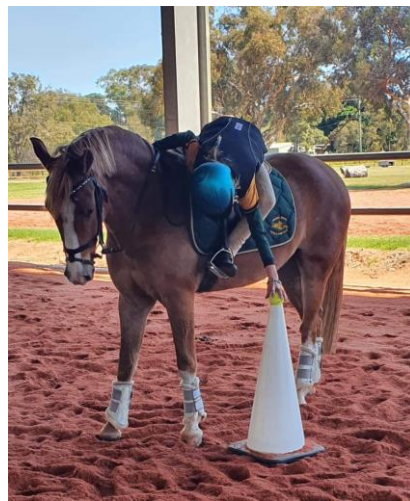
Left: Aleska and Bertie doing some fabulous reaching in their lesson

What great weather we had for our September rally. I hope everyone had a good day in their lessons. It is wonderful to see so many different activities being offered at rally by our amazing coaches. It was fantastic to see some of our groups participating in this month's healthy workshop. Good luck to our members who are sitting their E and D* certificates at the next rally.