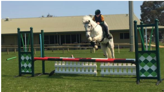
Left: Fae and Cisco getting some air time in their jumping lesson