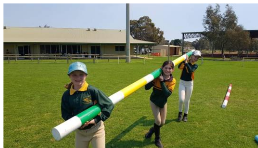
Above: Our super helpers lending a hand during pack away