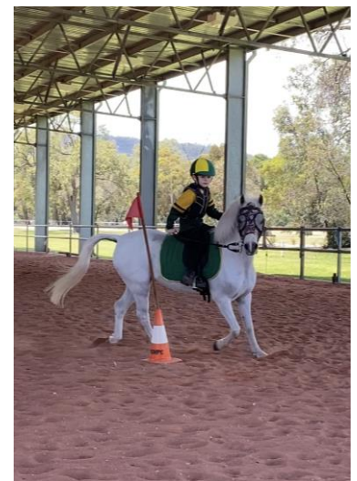
Above: Jasper and Shadow doing some nice bending during their games session