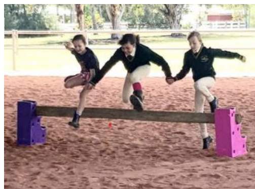
Left: Some of our riders letting loose after their exam