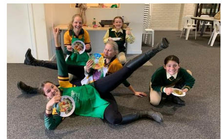
Above: Some of our members modelling the latest fashion from the Go 2&5 merchandise