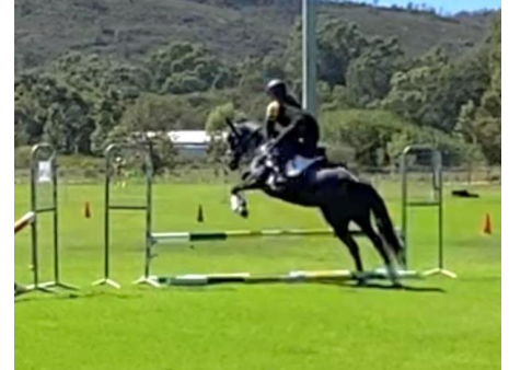
Right: Dana and Dolly flying over some jumps during their jumping lesson