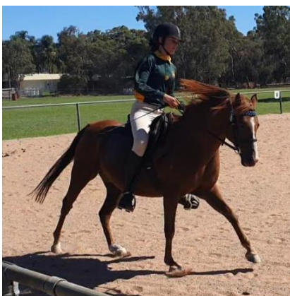
Left: Maniah-Rose and Piper doing some lovely canter work