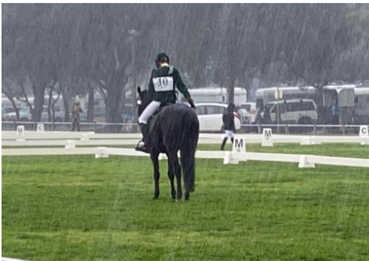
Left: Sophie and Rose doing a fantastic job riding their dressage test in very wet weather at the Serpentine ODE