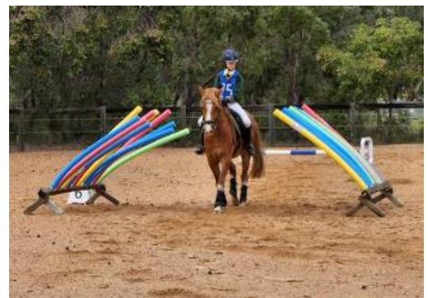
Above: Aleska and Bertie tackling the scary car wash obstacle during the handy pony course