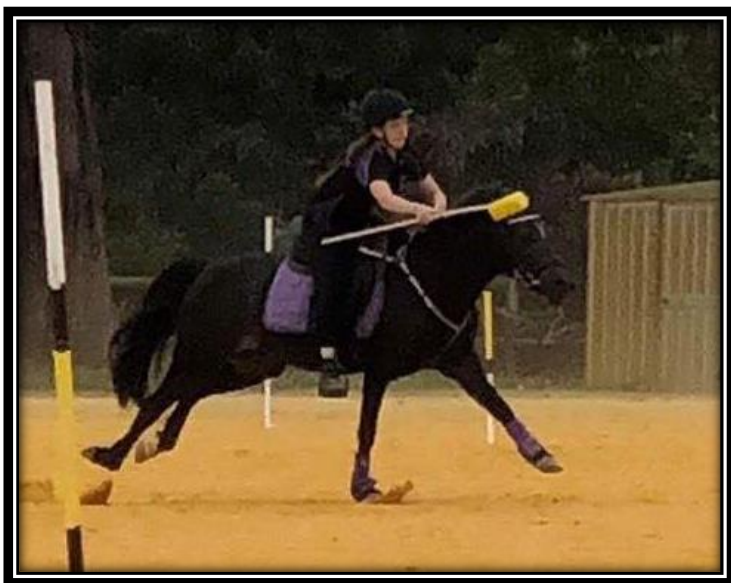
Ebony & Diva - MGA