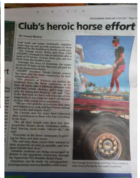
Above: OGHPC past and present members being recognised in the newspaper in recognition for all of their help with looking after many families and their horses who had evacuated from the Wooroloo bushfires