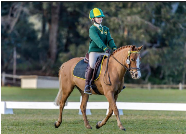
Above: Harpa and Lottie looking beautiful during their dressage test