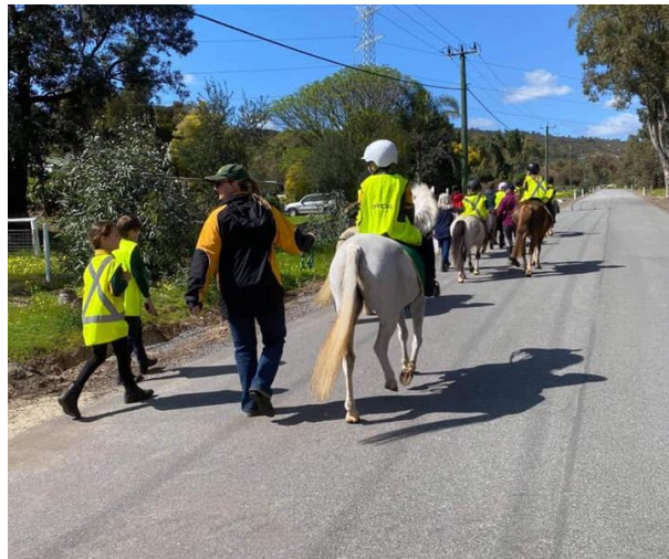
Left: Blueberry group being safety first by wearing their high vis vests