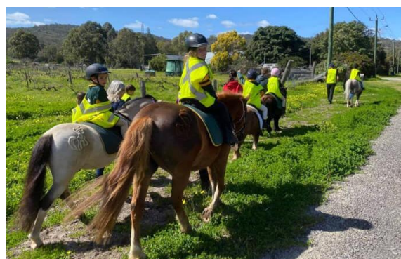
Left: Blueberry group going on exciting adventures on their trial ride