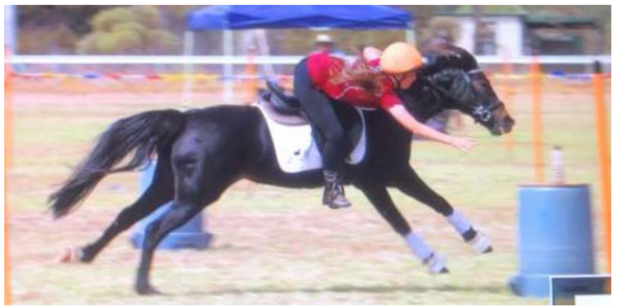
Above: Ebony & Diva - Wentworth NSW