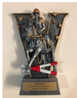
Left: Perpetual Trophy