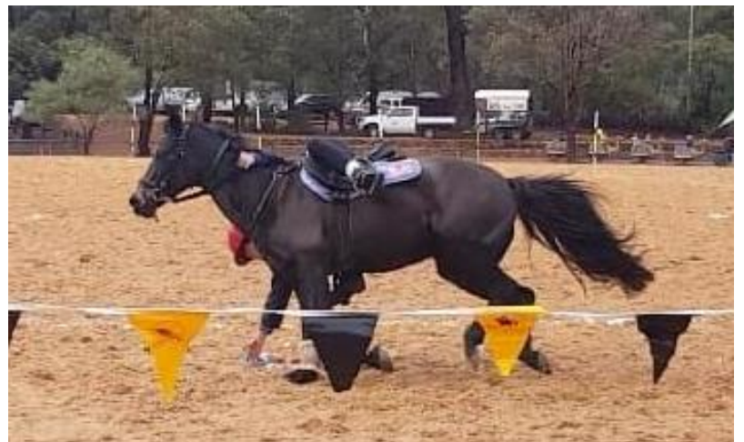
Above: Ebony & Diva - ground pick up