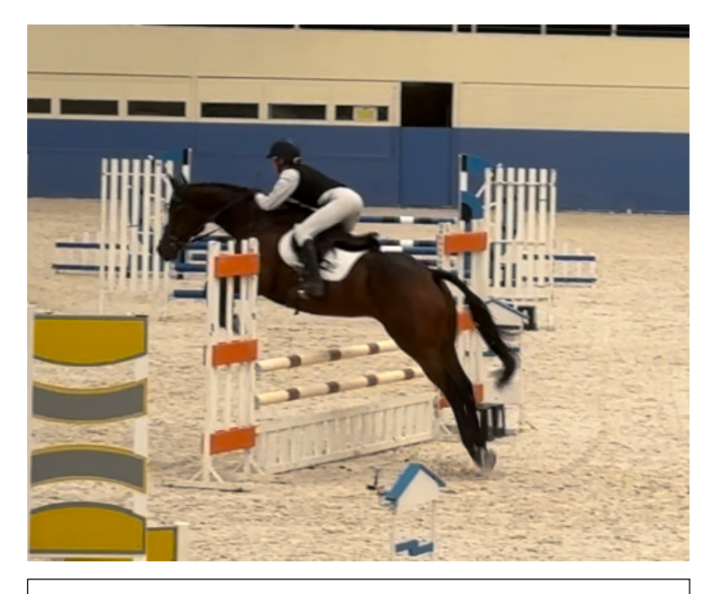
Suné competing at interschools, where she completed 6 rounds across 80/90cm over the week.