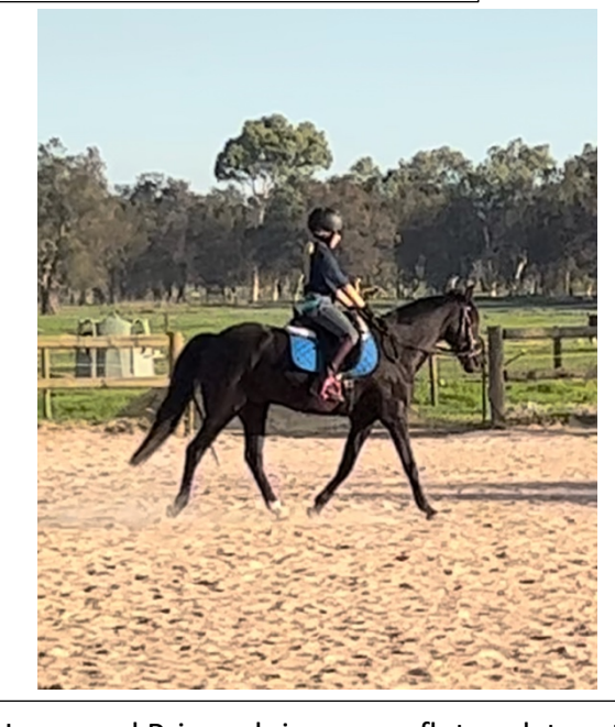
Harpa and Prince doing some flatwork together.