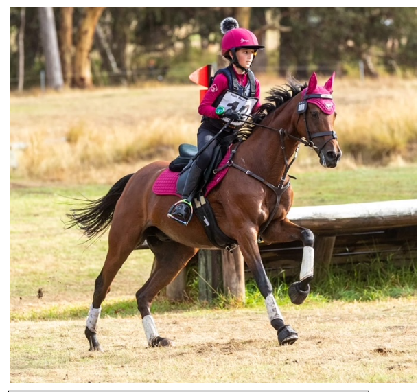
Hailey mid XC round at Harvey CCN.