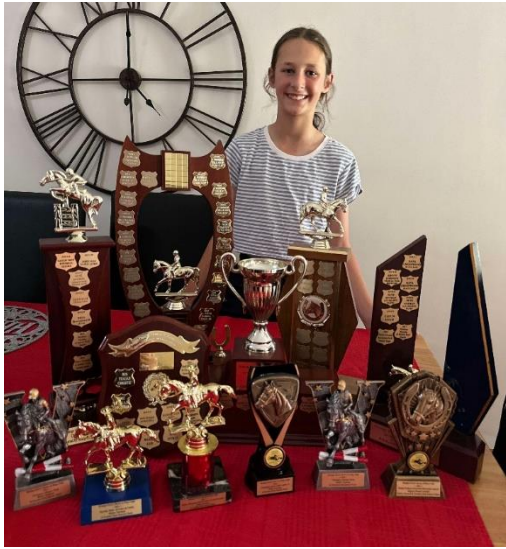
Hailey might need to bring a trailer next time!